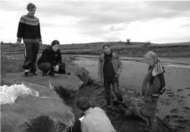
MAP project members taking samples at Leiruvogur Bay in Iceland during low tide. The samples were taken to the University of Kiel, Germany, for analysis.