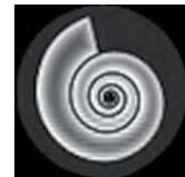
Logos of the Medieval Academy of America (left) and the Medieval Association of the Pacific (right). The 2014 annual meeting of MAA and MAP will take place at UCLA on April 10-12, 2014, hosted by CMRS..