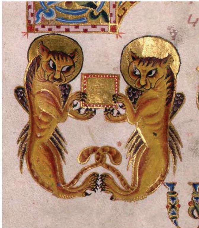
Detail, page 189, Gladzor Gospels (Armenian ms. 1; MS 170/466, Department of Special Collections, Charles E. Young Research Library, UCLA). The first initial of the Incipit to the Gospel of Mark is formed by two lions holding a book.