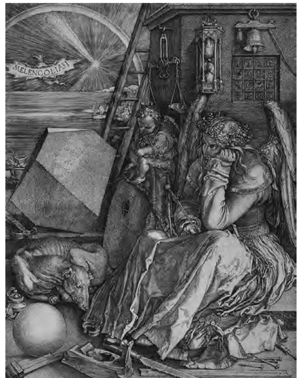
Melencolia I, an engraving by Albrecht Dürer, 1514.