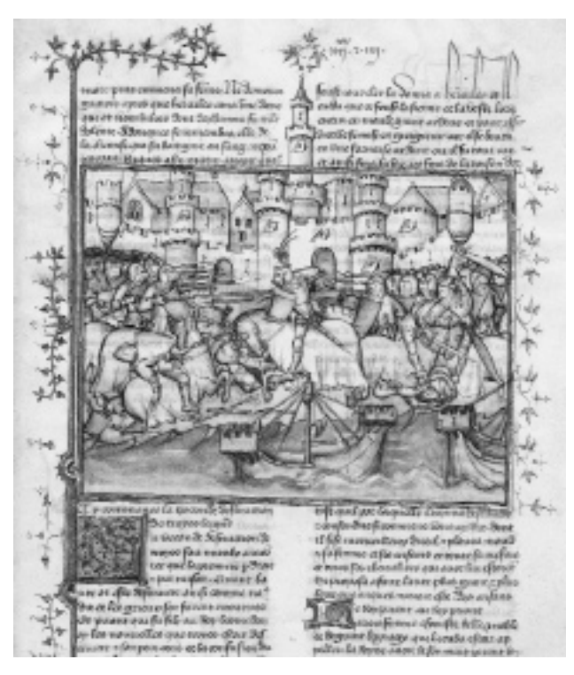
A Battle from the Trojan War, First Master of the Bible historiale of Jean de Berry. Leaf from Histoire ancienne jusqu'à César, Paris, ca. 1390–1400. Los Angeles, The J. Paul Getty Museum, Ms. Ludwig XIII 3, leaf 3.

The complete program for "The Future of the Past" will be posted on the CMRS website at www.cmrs.ucla. edu and on the J. Paul Getty Museum website at www. getty.edu. Advance registration and fee are required for some events.